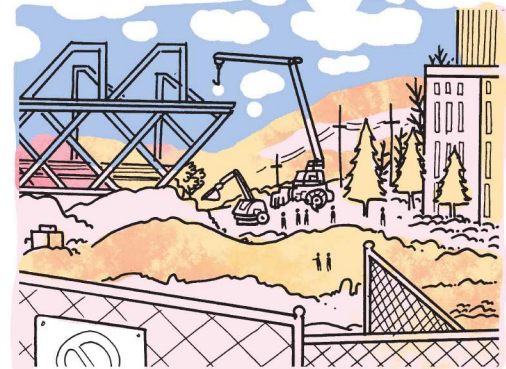
In 2009 the blacklist was released with 3,213 names on it.