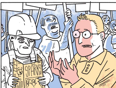
There was a mobilisation of much of the grassroots union movement.