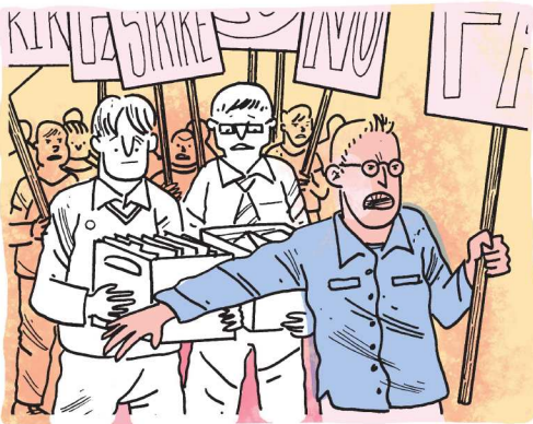
In June 2005 there was a 3 day strike.