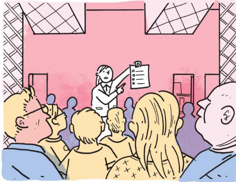
The 1970s were turbulent times, Jerry learned about democracy on the factory floor.